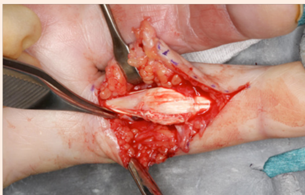
Figure 2: Thin and degenerative A3 pulley.